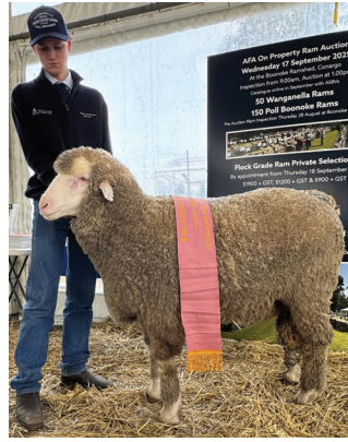
PB240424 x PB210231 x PB160612 Champion All Purpose Meat Merino Australian Sheep & Wool Show 2025 FD 20.7, SD 3.1, CV 15.0, CF 99.5, PP Held by Angus Knox

Poll Boonoke displayed the Champion Fine/Medium Wool March Shorn Poll Ram with PB240515 and PB240424 (Sefton) was the Reserve Champion Strong Wool March Shorn Poll Ram.