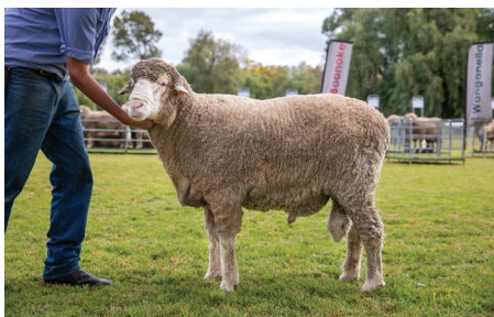
PB160612 – Photographed in 2020 as a 4 year old

Sadly we farewellled the notable Poll Boonoke Stud Sire PB160612 last October, the 2016 drop ram remaining robust and fertile right up until an injury took him out. Although outshone by his pen mate PB160536 in the show ring in 2017, 612 was to go on and become the Stud's most influential sire to date. His prepotency; particularly in his distinctive muscling, excellent conformation and soft, white lustrous wool; also made him a prominent industry sire with 4,500 doses of semen sold both domestically and internationally, with many repeat buyers. In the Australian Merino Sire Evaluation Association's September 2025 report on the "Top 20 High Use Sires – ASBVs for sires entered in Merino Superior Sires between 2020 and 2024", PB160612 rates in 4th place; with PB190678, PB200780 and PB160536 also making it into the top 20 listing. RIP PB160612.