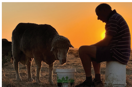
PB160612 – 'A Favourite', March 2025