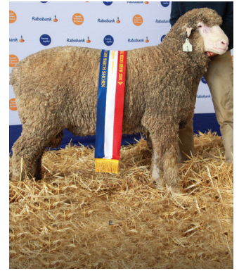
PB240515 x PB190678 Champion Fine/Medium Wool March Shorn Poll Merino Ram Rabobank National Merino Sheep Show 2025 FD 18.9, SD 2.9, CV 15.2, CF 99.8, PP