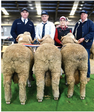
Wanganella 242433, 240311 & 241731 1st – Elders Pen of Three March Shorn Rams Rabobank National Merino Sheep Show 2025