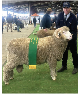
W241731 x W220391 x W200231 Reserve Champion Medium Wool March Shorn Merino Ram Rabobank National Merino Sheep Show 2025 FD 17.9, SD 3.1, CV 17.3, CF 99.8 Photographed with Angus Munro