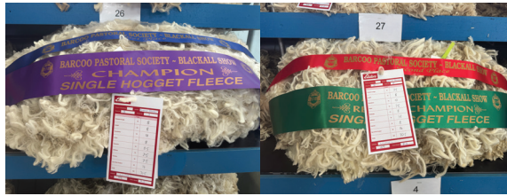
MacDonald Family's 'Lilyveil' Hogget Ewe Fleeces – Champion & Reserve Champion at 2026 Blackall Show