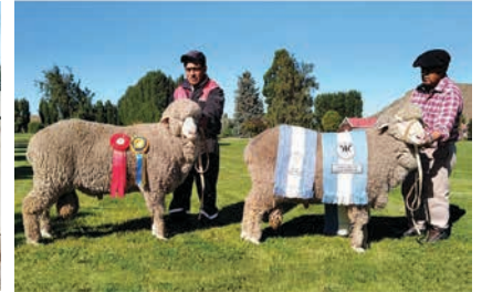
Tecka Poll X210291 & Tecka Poll X210309