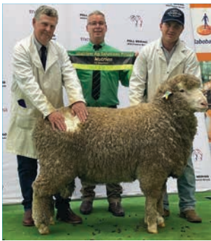
PB211153 at Adelaide Royal Show 2022 after winning the Fibre Meat Plus Class.