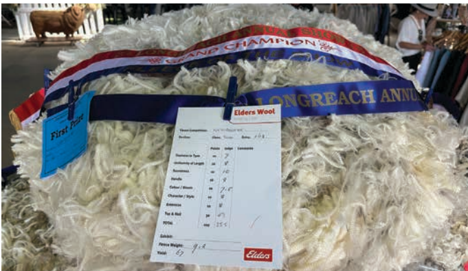
Westbourne's Grand Champion Fleece at the 2023 Longreach Show