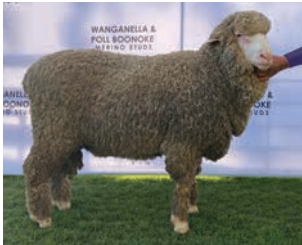
PB211016 , Champion Strong Wool March Shorn Ram, National Merino Show at Dubbo 2022.