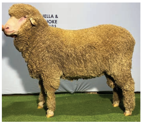
POLL BOONOKE 190084 (PP) SIRE: WIL170018

In addition to PB190678, sold by private treaty to Haddon Rig in 2020, some of the other 2019 drop rams that we used in our in our own breeding program and who now have lambs on the ground follow. COVID meant that their inspection as a shedded ram last year was limited, but as for PB190678, semen is available. They are in the Ramshed again this year, so contact one of the Stud Team if you would like to inspect them.