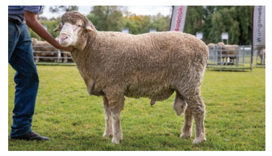
PB160612 - Photographed as a four year old in 2020

With more than 200 doses of semen sold from both rams in 2020 their direct influence across the industry is set to continue for some time yet.