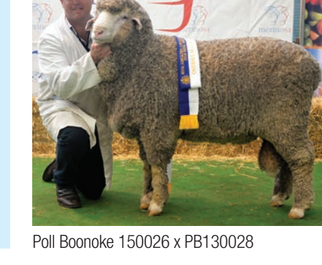
Merino Superior Sires (MSS) is an evaluation program that compares the breeding performance of nominated sires by evaluating their progeny through a large number of expressed traits that have been identified as of importance by

expressed traits that have been identified as of importance by stud and commercial breeders. Merino Sire Evaluation (MSE) program is a national program that is currently operating at 9 sites across