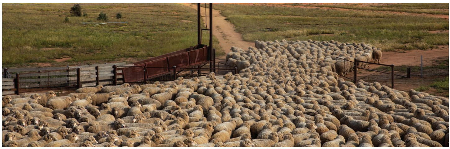
Boonoke Commercial 2015 Drop Ewes Black Sandhill Yards, Boonoke, Conargo

Merino breeding engages you in an interesting and innovative industry with exceptional sustainability, however, the commercial reality is that superseding every other breeding motivation is flock profitability. There is an abundance of information and opinions available about every aspect of Merino breeding, but with 73,000 Merino ewes joined in the AFA business the Stud Management Team remain firmly focused on breeding Merino sheep to maximise economic returns. We are fortunate to have such an experienced Stud Management Team navigating the direction of the Wanganella and Poll Boonoke sheep. Productive, Balanced, Measured remains the key to our stud breeding objectives ... and in that order.