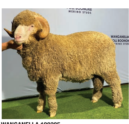
WANGANELLA 190305 SIRE: W170470

Poll Boonoke 190084 is an ET bred son of Willandra Poll 170018. He has a pure face and eyes, and a long muzzle. A plain bodied, well shaped ram, he has a straight topline with extra width across the loin and an ideal square behind. PB190084 has tremendous length of staple and bright, shafty wool on a productive skin. He is a bold medium wool dual purpose sire.