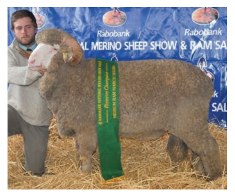
Wanganella 150610 x W130750

The Australian Merino Sire Evaluation Association (AMSEA) manages both the MSE program and the MLP project at a national level. The AWI funded Merino Lifetime Productivity (MLP) Project is designed to capture lifetime data across diverse environments and Merino types to help better understand and deliver Merino ewe lifetime performance outcomes for the Australian Merino Industry. The project is a 10 year partnership between AWI, AMSEA, nominating stud breeders and site hosts.